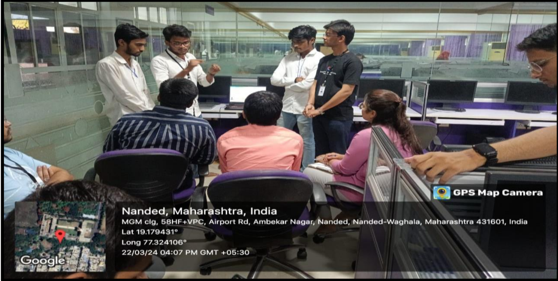
Glimpses of SparkIgnite Ideathon