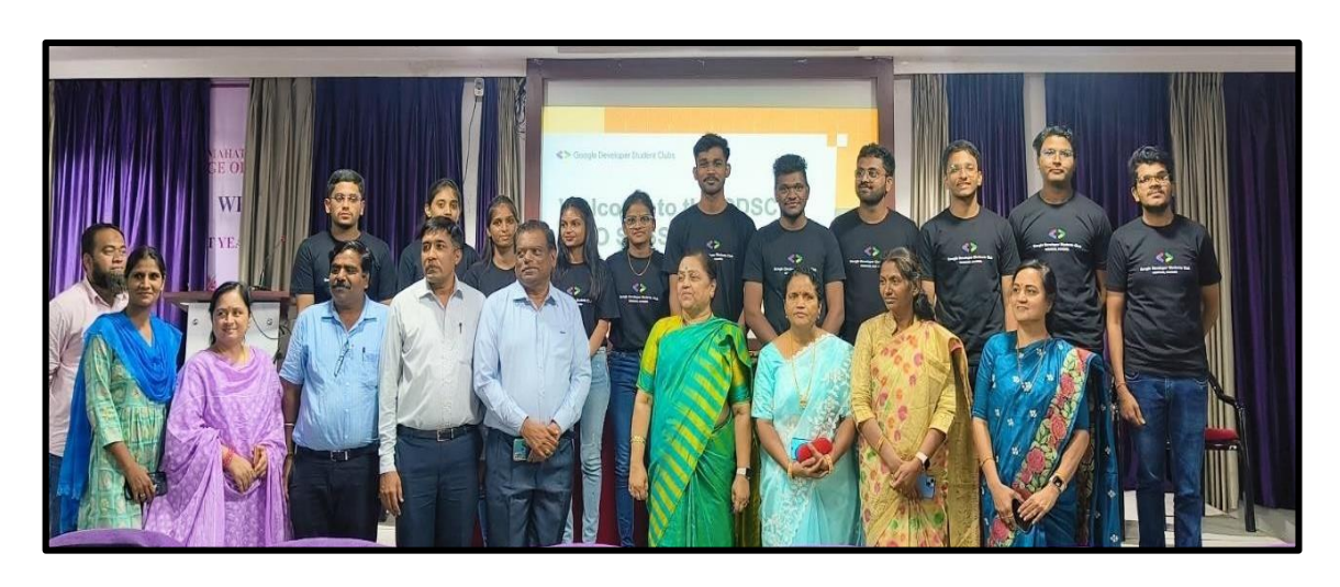
GDSC Info Session