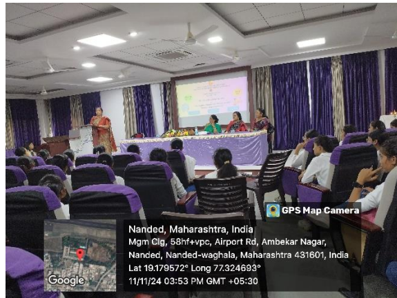
Glimpse of the Expert talk